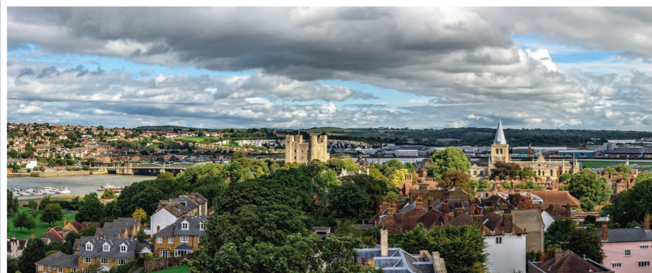
SOME OF OUR DEVELOPMENTS DELIVERED IN 2019

IN THE SEVENOAKS, MEDWAY, ASHFORD, MAIDSTONE AND CANTERBURY AREAS.